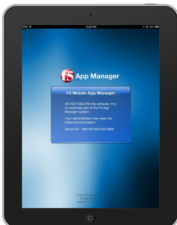
Figure 1: F5 Mobile App Manager

As the proliferation of mobile devices in the enterprise has created new challenges for IT administrators, they must be able to control devices coming into their network, track inventory, monitor for threats and vulnerabilities, and protect corporate information. At the same time, they must simplify the process of provisioning devices for WiFi, VPN, etc., and support configuring access to email, contacts, calendars, and other essential communication tools.