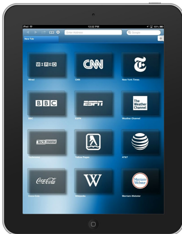
Figure 2: MAM Browser

Many web browsers, including mobile browsers, are configured to provide unfettered functionality to the detriment of security. Browser vulnerabilities are one of the easiest ways to get malicious code running on a smartphone, and many mobile apps are reliant on the mobile device's browser for functionality. Plug-ins and add-ons to support Java, JavaScript, Ajax, and other interactive web enhancements can expand the risk. In addition, tools like tracking cookies can impair a user's privacy, and all these browsers are susceptible to cross-site scripts and other website vulnerabilities. Plus, as with email, corporate web navigation is being handled by the person's personal, default web browser. This is not to mention the IT nightmare of needing to support all of the various mobile browsers residing on employees' smartphones.